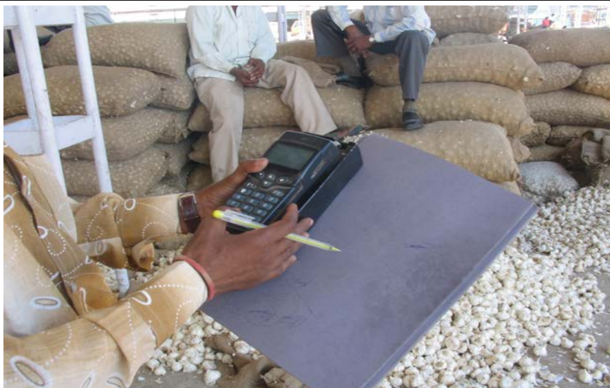
Figure 1. Hand-held Device for Recording Transactions at Market Yard

The photograph in Figure 1 is part of a set of 20 photographs taken from January to March 2009 for a study on the introduction of information systems to a rural setting (Vaidya, 2012). In a context characterized by distrust among different stakeholders (i.e., government officials, traders, farmers, and private partners), the launching of the e-Krishi Vipanan Initiative in 2003 in the Indian state of Madhya Pradesh brought computer technology to the agricultural market yards. The intention was to make transactions transparent and protect the farmers, the usual victims of widespread corrupted practices. The project was eventually abandoned in 2011. The assumption that introducing information technology could change unfair practices proved to be wrong. The handheld device shown in Figure 1 was used to capture transaction data (e.g., trader name, commodity type and weight, auction rate) at one of the market yards. The photographs accompanying the textual description provide a vivid account of every step of the trading process: from data captured at any given yard, automatically uploaded to a central server, and redistributed through a very small aperture terminal satellite to other yards and government offices across the state, to commodity prices displayed on websites at government offices, or to TV sets at other yards. In this way, farmers had information on the auction rates at various other yards.