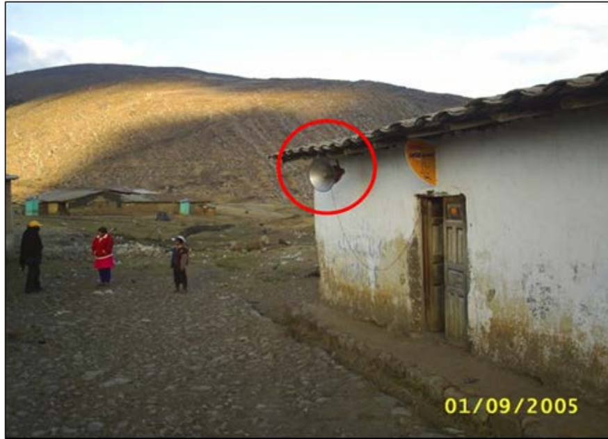
Figure 3. The Unnoticed Information During The Fieldwork: The Tele-center's Loudspeaker (Circled)

A second look at Figure 3 reveals the loudspeaker (circled) just under the tele-center's eaves. The loudspeaker was frequently used to announce incoming calls; after an initial call, the caller would ring again in ten minutes or so to allow the addressee time to make their way to the tele-center. This common practice reflected how local people use the provided tele-centers. This example serves to illustrate how the lived-in experience of the fieldwork prompted the researcher's recollection of the details found in the field. The researcher may well discover things that might have been unnoticed during the fieldwork on calm reflection once at home (Strecker, 1997).